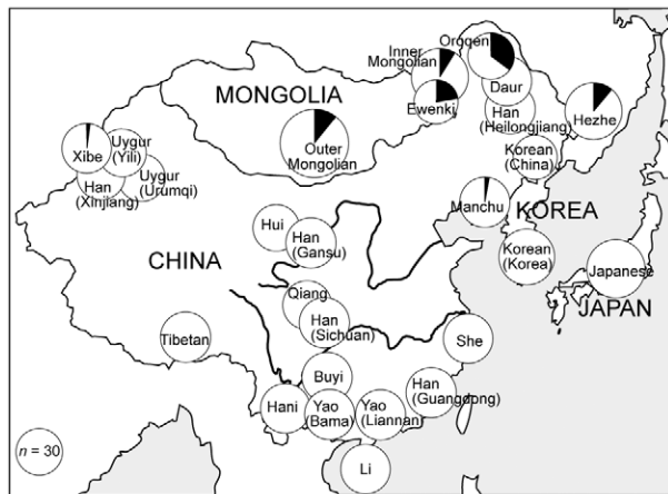
Figure 3 Geographical distribution of Manchu cluster chromosomes. Circles , Populations sampled, with area proportional to sample size. Filled sectors , Manchu clusters.

maintained many concubines. A central part of the Qing social system was the army, the Eight Banners, which was made up of separate Manchu, Mongolian, and Chinese (Han) Eight Banners. The nobility occupied high ranks in the Manchu Eight Banners but not in the Mongolian or Chinese Eight Banners; the Manchu Eight Banners were recruited from the Manchu, Mongolian, Daur, Oroqen, Ewenki, Xibe, and a few other populations. A social mechanism was thus established that would have led to the increase of the specific Y lineage carried by Giocangga and Nurhaci and to its spread into a limited number of populations. We suggest that this lineage was the Manchu lineage.